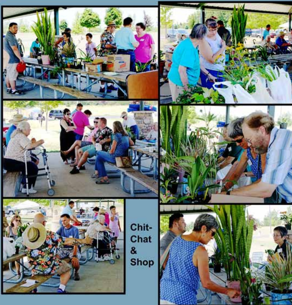
Chit-Chat & Shop

Despite the heat and the low number of people, plant sales (fixed price + auction) earned GLOS $576... we have some dedicated plant people in the Society!