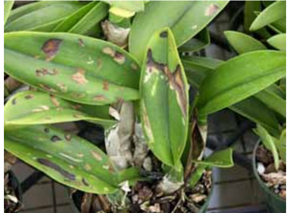
This Cattleya Alliance hybrid shows unsightly and permanent damage from mesophyll cell collapse.