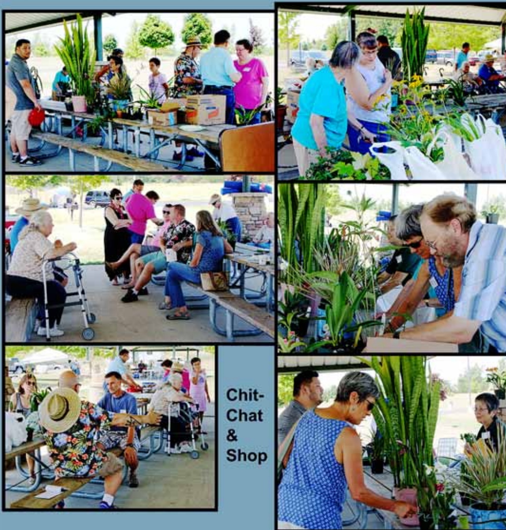
Chit-Chat & Shop

Despite the heat and the low number of people, plant sales (fixed price + auction) earned GLOS $576... we have some dedicated plant people in the Society!