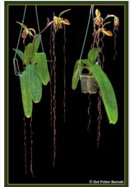
Paph. sanderianum x 2