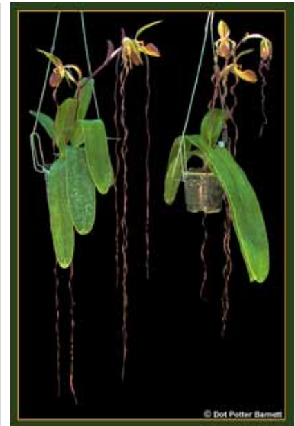
Paph. sanderianum x 2