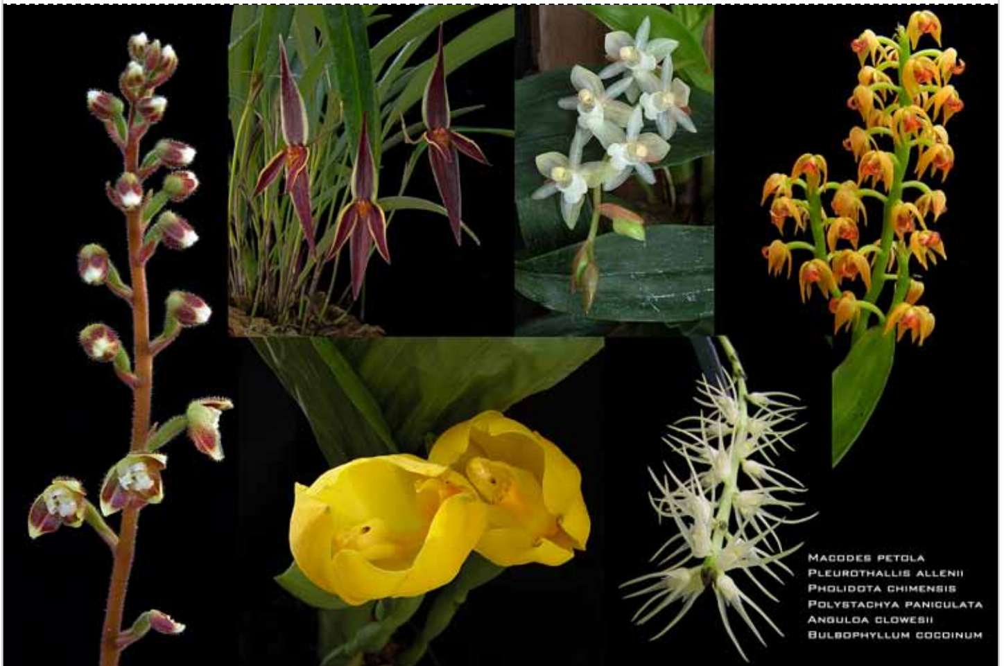
MAGDUS PETOLA PLEUROTHALLIS ALLENII PHOLIDOTA CHIMENSIS POLYSTACHYA PANICULATA ANGULOA CLOWESII BULBOPHYLLUM COCCINUM