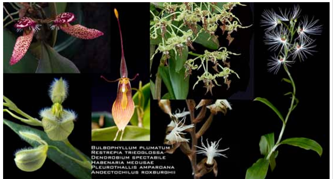
BULBOPHYLLUM PLUMATUM RESTREPIA TRIOGLOSSA DENDROBIUM SPECTABILE HABENARIA MEDUSAE PLEUROTHALLIS AMPAROANA ANECTOCHILUS ROXBURGHII

Some "weird and wonderful" pictured below and on the back page.