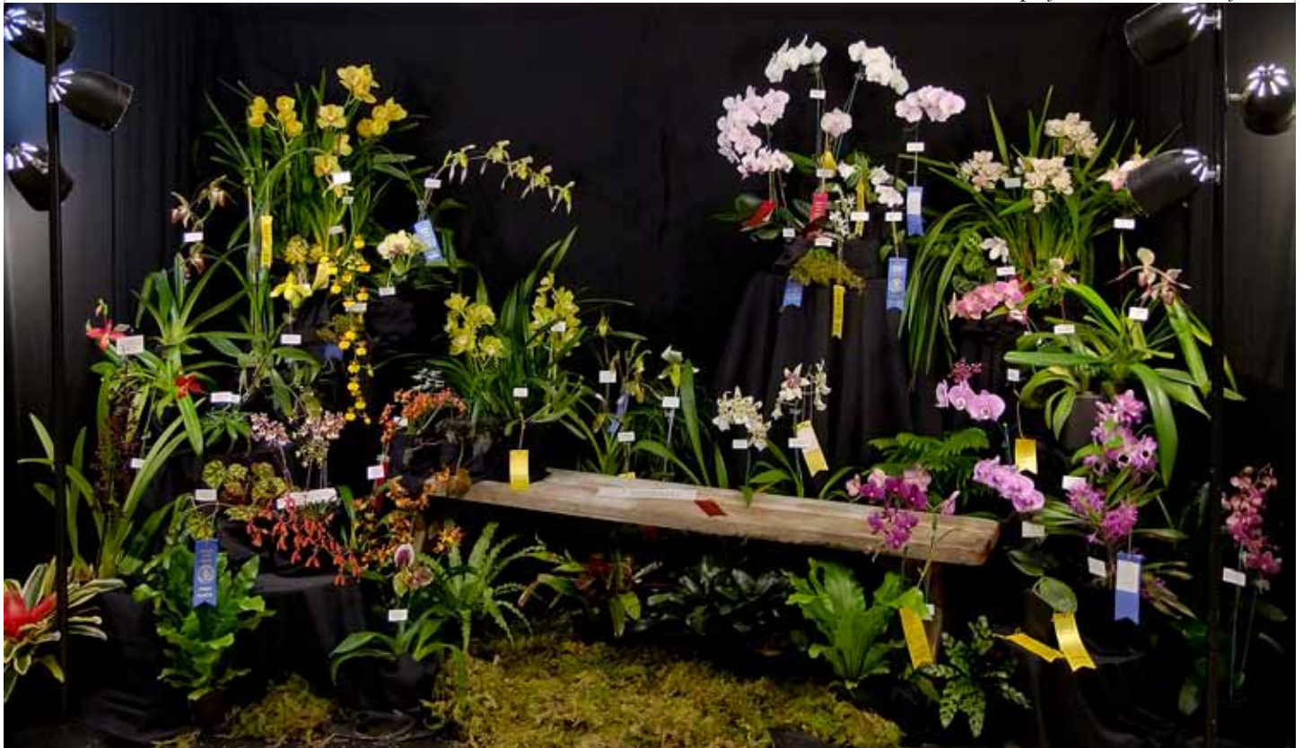
GLOS Display at MOS