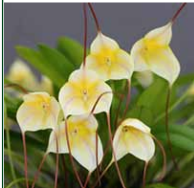
Masdevalia Razzle Dazzle