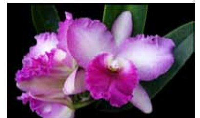
Ryntonleya (Ctna, Maui Maid x Rlc Dr. Joe Walker)