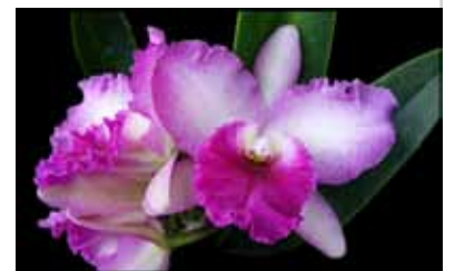
Ryntonleya (Ctna, Maui Maid x Rlc Dr. Joe Walker)