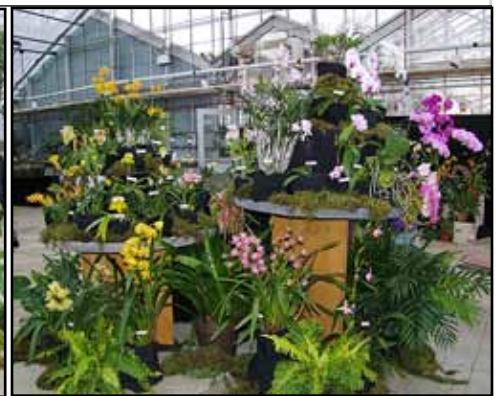
GLOS Display, February 2016