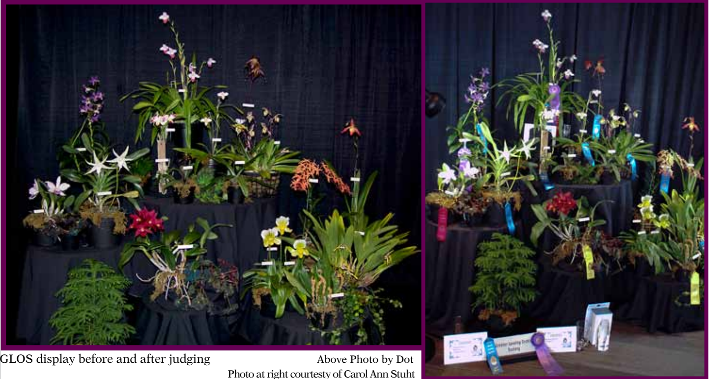
GLOS display before and after judging