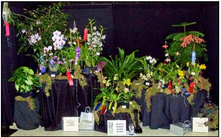
Above photo -- after judging Photo below -- before judging